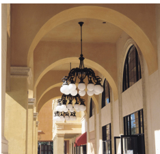
Miami - US

Neri Branch office DUBAI 29-13 Reef Tower Cluster O JLT - Jumeirah Lake Towers P.O. Box: 115738 T +971 4 448 7246 F +971 4 448 7112 E neri.me@neri.biz