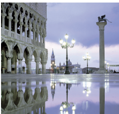
Venezia - I