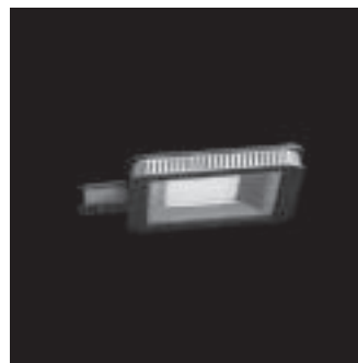
MATAR - Contemporary | Performance