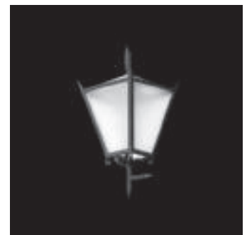
SIENA LANTERN - Custom project