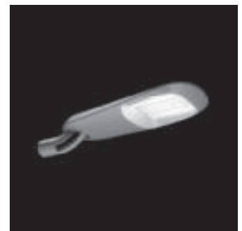
ARCHILEDE S - Performance