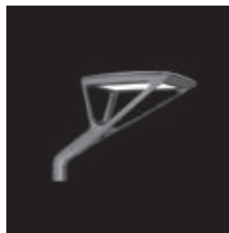
ALYA - Contemporary | Comfort

Highly sophisticated equipment that is unique in different ways: such as one of the largest and fastest goniophotometers in use in Europe, which makes it possible to test the lighting performance of products and to check compliance to restrictive regional norms on light pollution. We also have a "Light room", a test set that is the most attractive and technologically advanced at Neri – a type of wind tunnel through which light "blows".