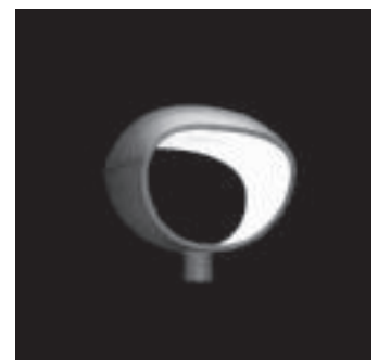
HYDRA - Contemporary | Comfort