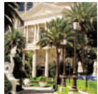
Las Vegas - USA