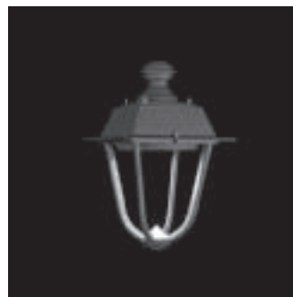
LIGHT 804 - Heritage | Comfort