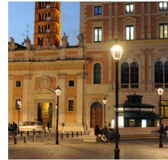
Roma - I