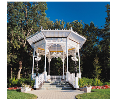
New York - US