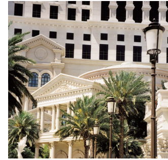
Las Vegas - US

Efficiency, thermal management, glare, study of optics, material selection, lighting quality and connectivity. For Neri, Research and Development means working with determination and consistency around these issues which are crucial for lighting, product development and the sustainability of products. Stressful environments for points and surface finishes is simulated by salt spray fog and by cyclic UV-A and humidity. This accelerates the aging process giving forecast on what will happen. But company knowhow, gained over the years, also comes from the technological developments achieved in our laboratories. A distinctive heritage and wealth of experience means that Neri has also been awarded the best quality certifications, including the recent UL certification of our laboratories allowing rapid deployment of standards approved solution worldwide.