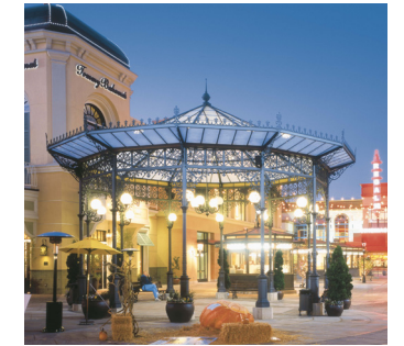
Portland - US