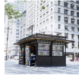
New York - US