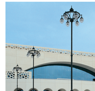
Abu Dhabi - UAE