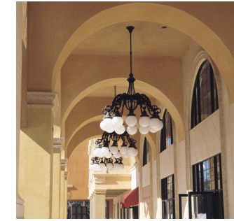
Miami - US