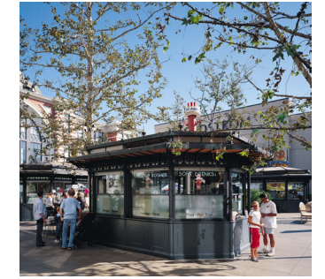
Los Angeles - US