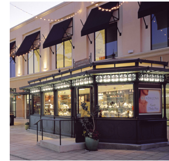
Portland - US