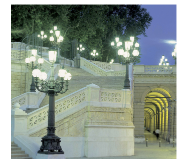
Bologna - I