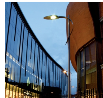
Cork - IR