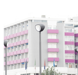
Senigallia - I