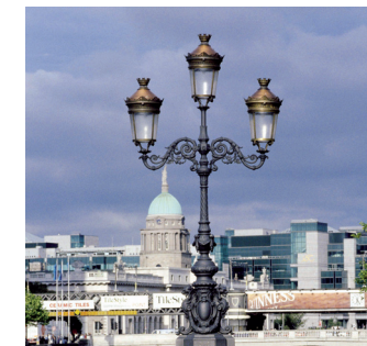
Dublin - IR