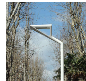
Bellaria - I