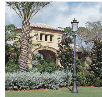
Miami - US