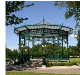
Chicago - US