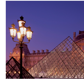
Paris - F