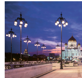
Moskva - RU