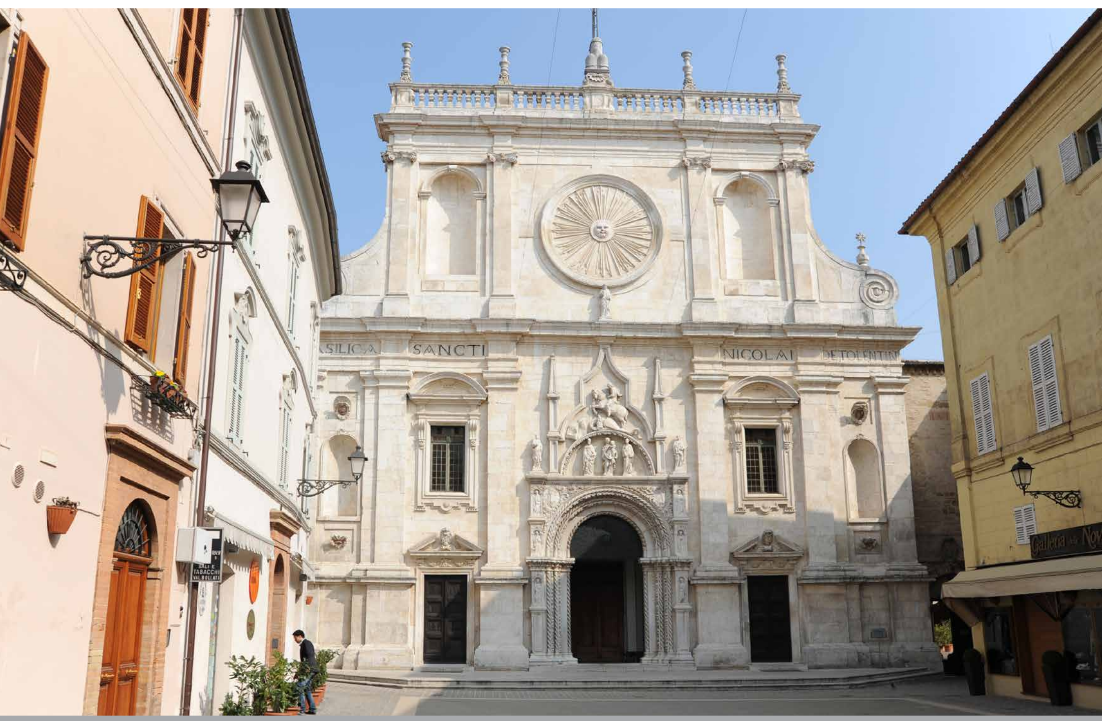
Earthquake | Homage to a wounded Italy