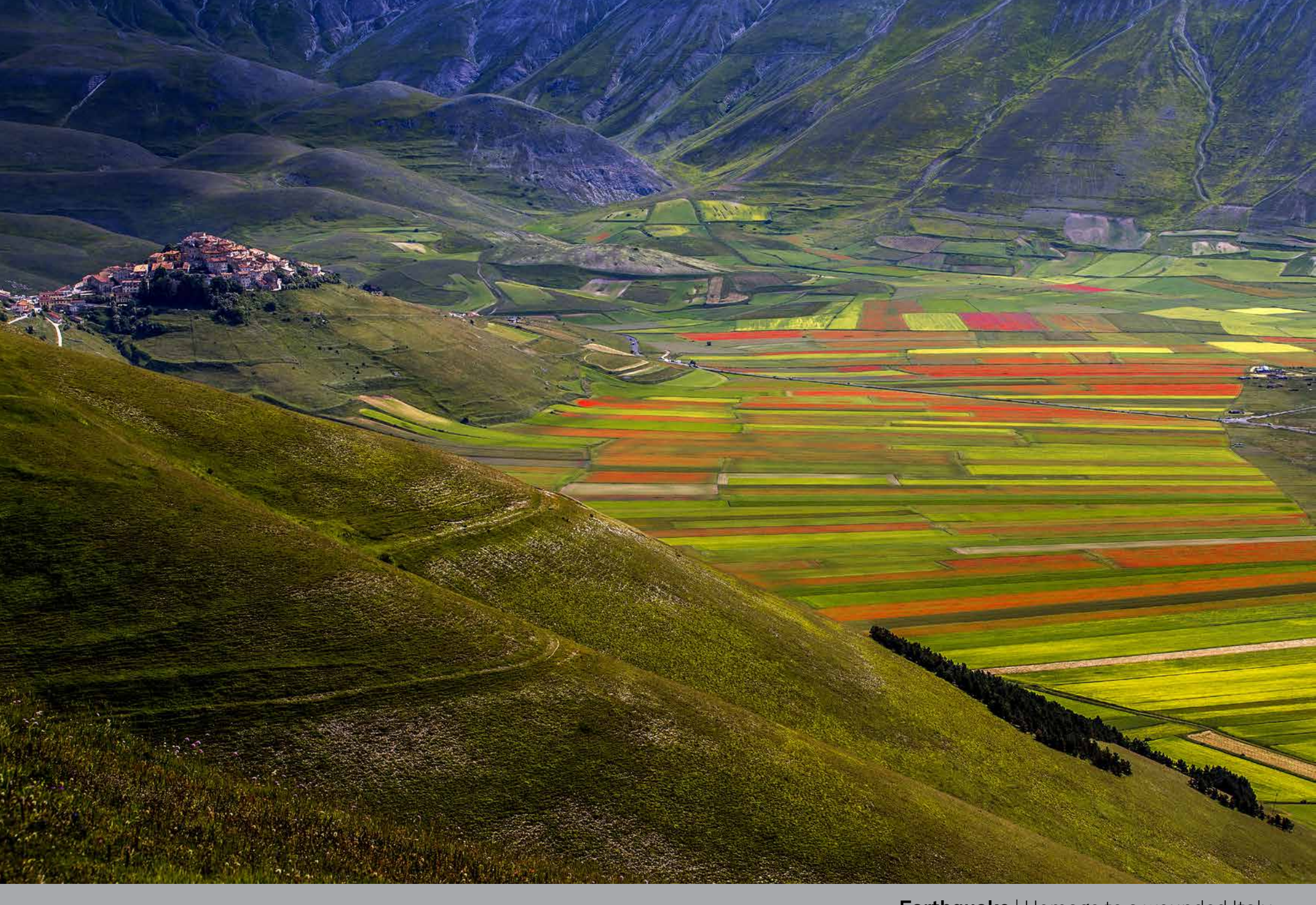
Earthquake | Homage to a wounded Italy