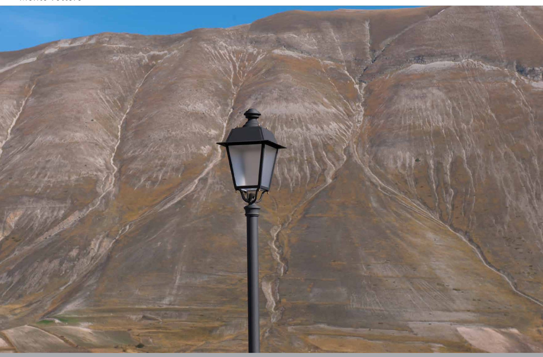
Earthquake | Homage to a wounded Italy