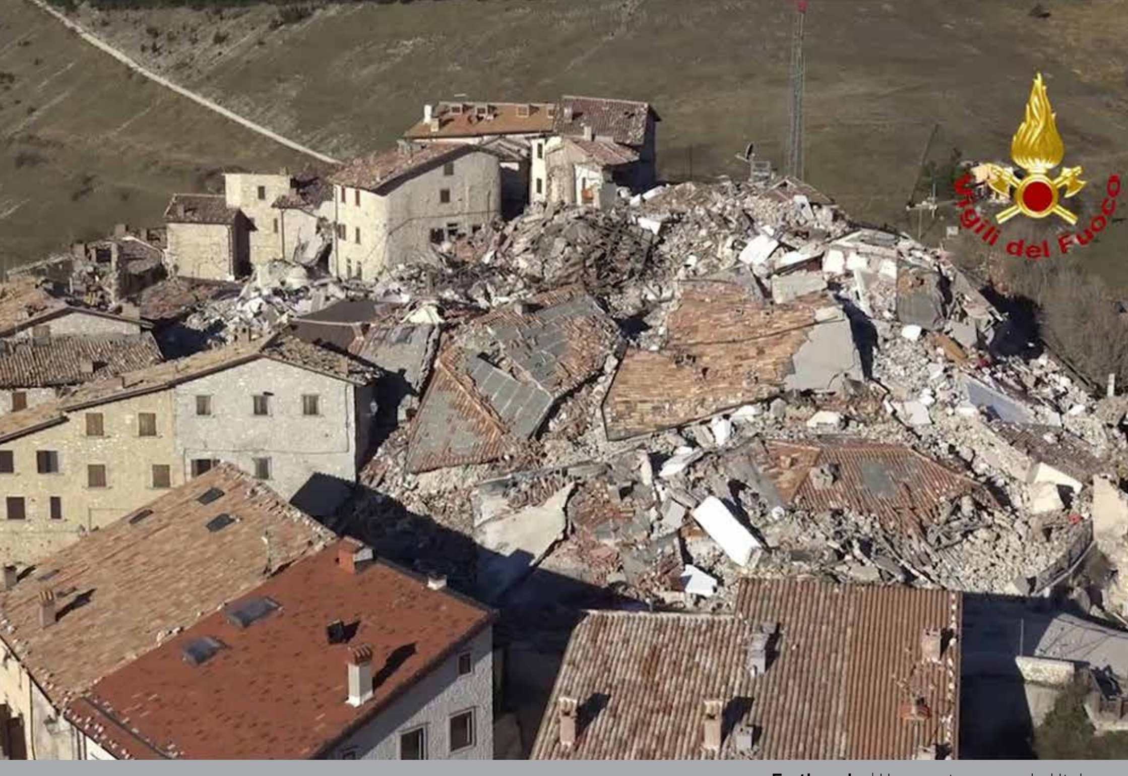
Earthquake | Homage to a wounded Italy