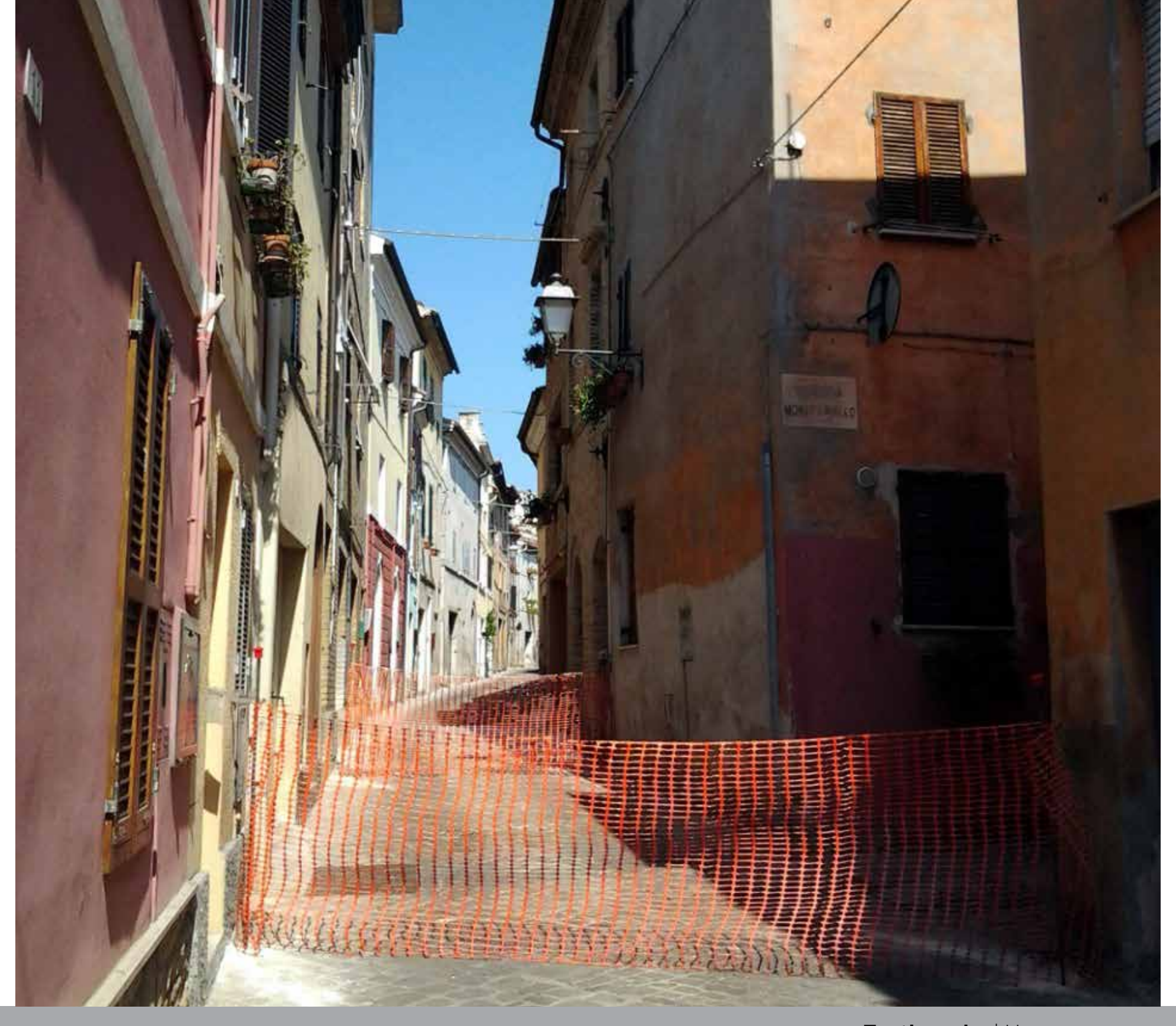
Earthquake | Homage to a wounded Italy