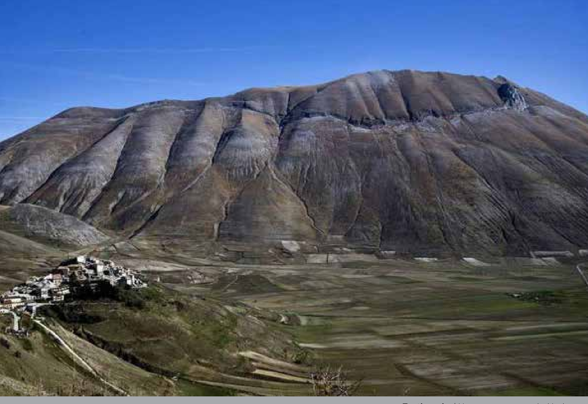
Earthquake | Homage to a wounded Italy