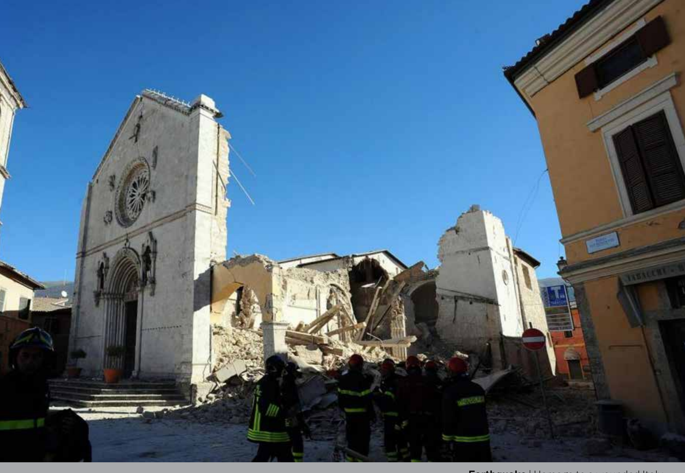
Earthquake | Homage to a wounded Italy