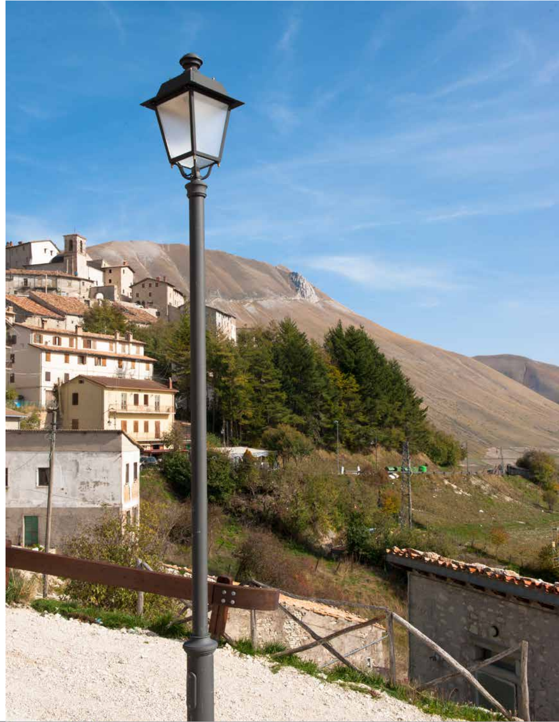
Earthquake | Homage to a wounded Italy